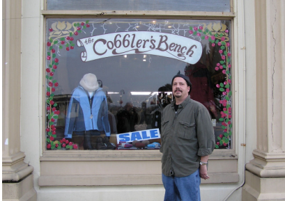
Small Businesses Support Measures 66 & 67

As a small business owner in Oregon I feel responsible to contribute to the well being of our state and local communities. Measures 66 & 67 are essential to maintain the quality of life and our continued business success. Taxes are the price we pay for a civilized society.